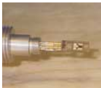
The DMT242 dewpoint transmitter incorporates the DRYCAP polymer sensor.

If dew forms on the sensor element, the DRYCAP® sensor fully recovers after it has dried